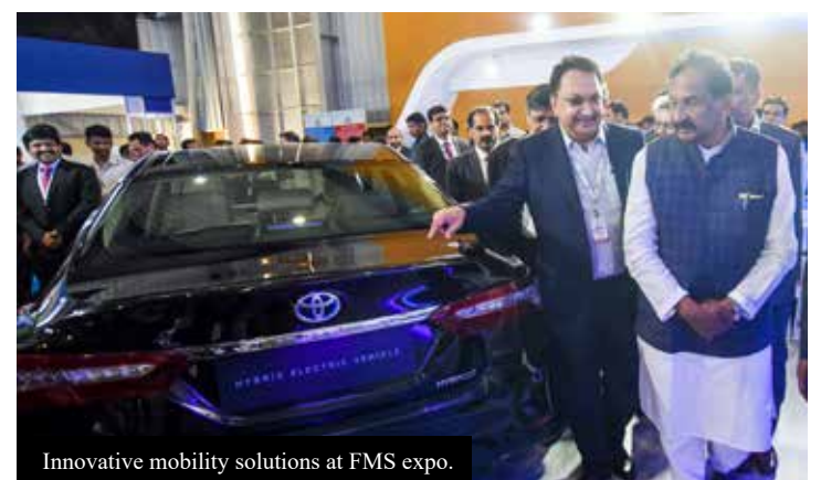
Innovative mobility solutions at FMS expo.

Future Mobility Show to address the issues of clean and sustainable environment, energy security and job creation in a technology agnostic manner. The show has been designed to see mobility holistically and discuss solutions relevant to India.