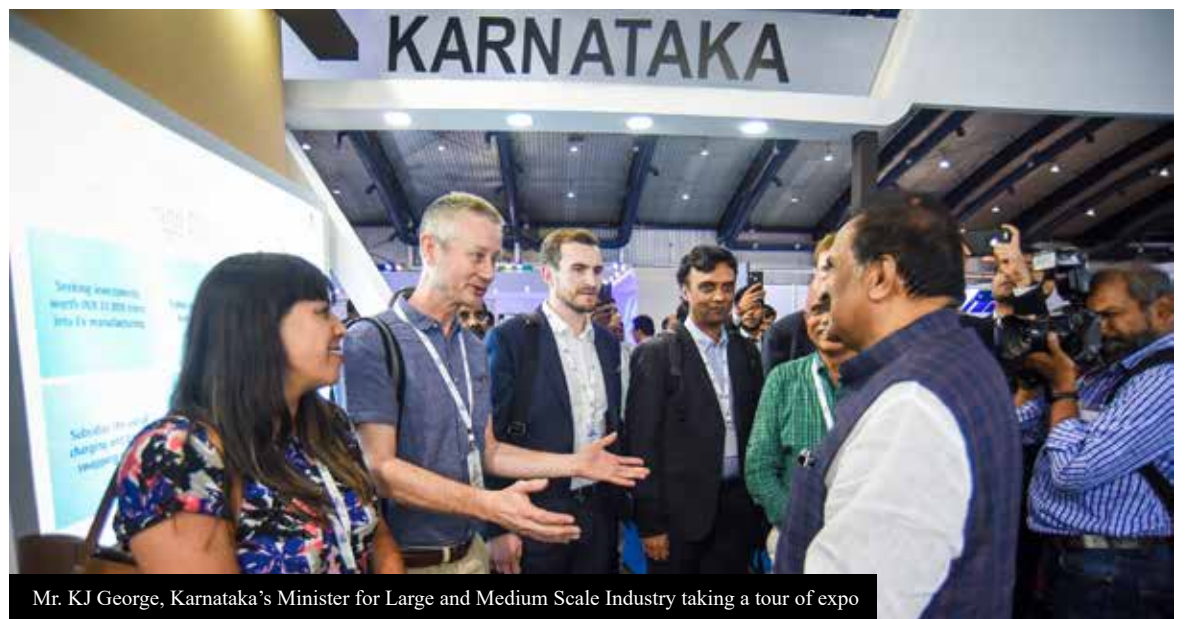
Mr. KJ George, Karnataka's Minister for Large and Medium Scale Industry taking a tour of expo

E-mobility is already shaping and will continue to shape the automotive industry in India and around the world, said K J George, Minister for Large and Medium Scale Industry, Government of Karnataka, while addressing the Future Mobility Show (FMS) 2019, the largest show focused on products and technologies for future mobility.