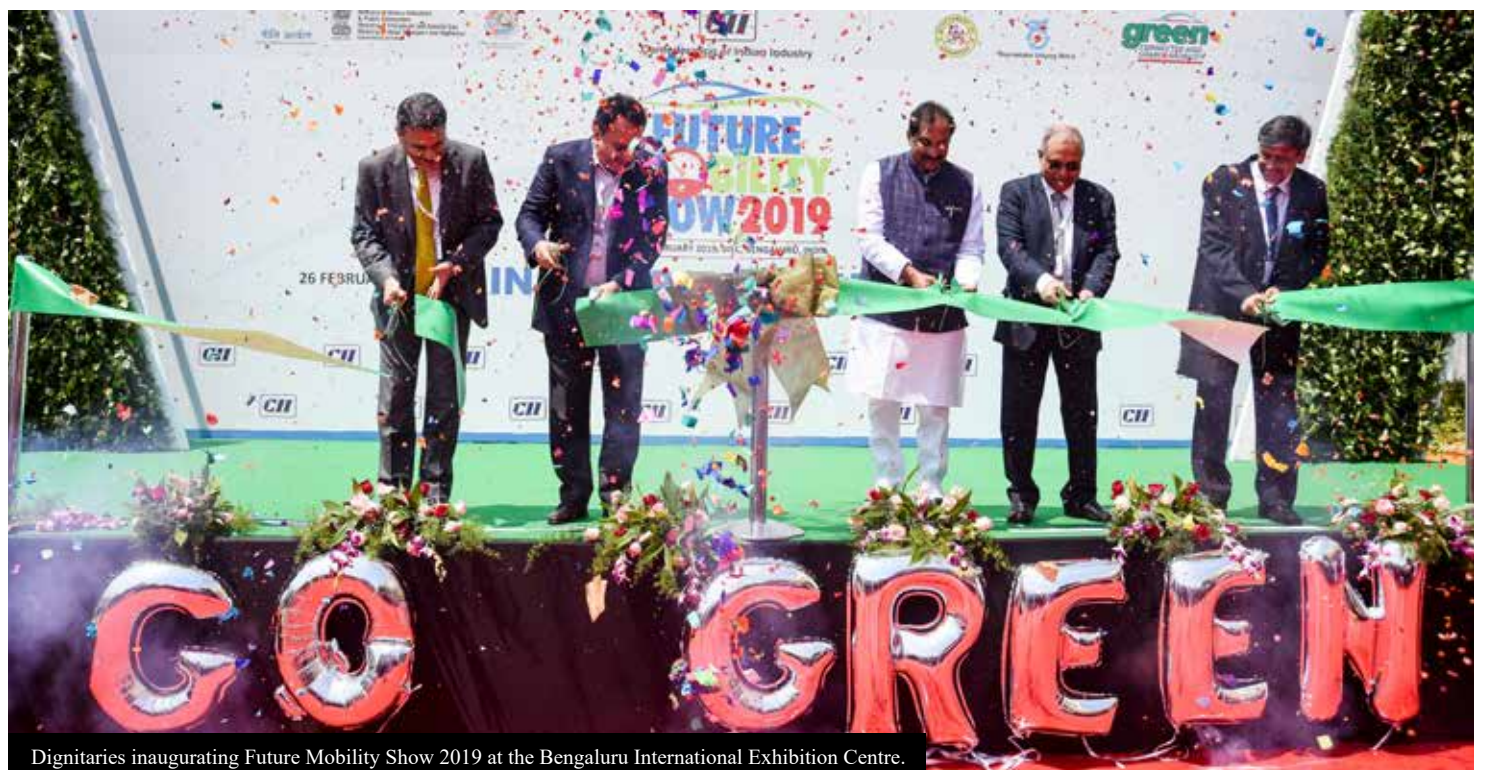
Dignitaries inaugurating Future Mobility Show 2019 at the Bengaluru International Exhibition Centre.

FMS 2019 also reflects the forces that are driving the new mobility ecosystem in India. The show has brought together top mobility industry leaders, startups, technology providers, government decision makers and countries.