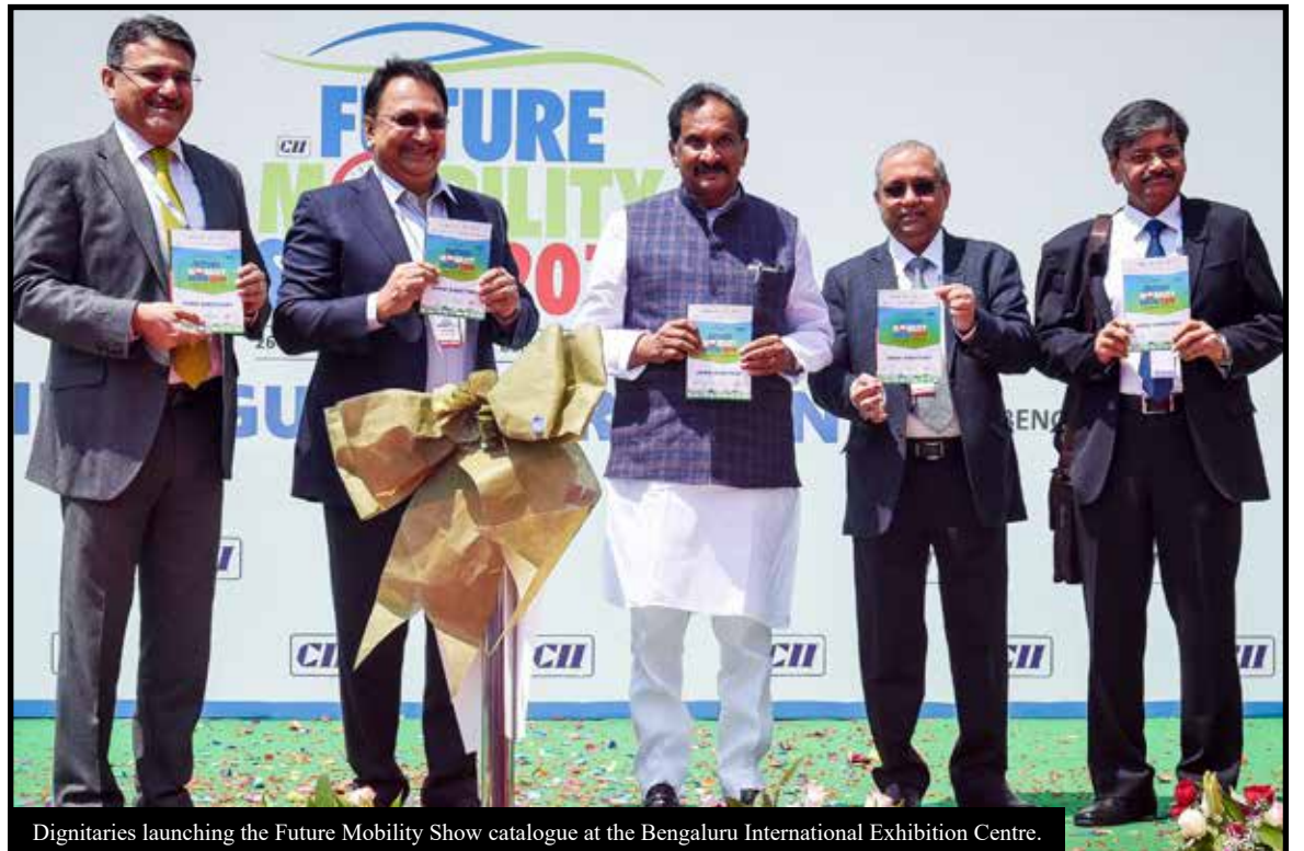
Dignitaries launching the Future Mobility Show catalogue at the Bengaluru International Exhibition Centre.

FMS aims to not only look at a mobility transition for the country but also look at energy security for the nation to help achieve India's climate change commitments, in line