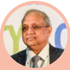
Mr. Chandrajit Banerjee Director General, CII

The Government of India has shown a great will to transform the mobility landscape of India by adopting new policies like the National Policy on Biofuels, National Electric Mobility Programme. Also in the works is the newer version of FAME I. Recent fiscal incentives with customs duty cuts on hybrid and EV cars also augur well for India's mobility transition.