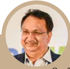
Mr. Vikram Kirloskar Vice President Confederation of Indian Industry

Karnataka has realised the relevance of Electric Mobility and has emerged as a frontrunner, determined to play a vital role in driving EV penetration. Karnataka, a pioneer state, home to first electric vehicle in the country along with the required ecosystem, is at the cusp of making a transition to new mobility solutions.