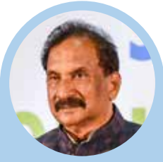
Mr. K.J. George Minister of Large & Medium Industries Government of Karnataka

Karnataka has realised the relevance of Electric Mobility and has emerged as a frontrunner, determined to play a vital role in driving EV penetration. Karnataka, a pioneer state, home to first electric vehicle in the country along with the required ecosystem, is at the cusp of making a transition to new mobility solutions.