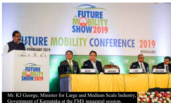
Mr. KJ George, Minister for Large and Medium Scale Industry, Government of Karnataka at the FMS inaugural session.