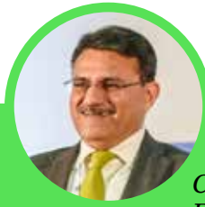
Mr. Manoj Kohli Chairman, CII Task Force on Electric Mobility and Storage

The Government of India has shown a great will to transform the mobility landscape of India by adopting new policies like the National Policy on Biofuels, National Electric Mobility Programme. Also in the works is the newer version of FAME I. Recent fiscal incentives with customs duty cuts on hybrid and EV cars also augur well for India's mobility transition.